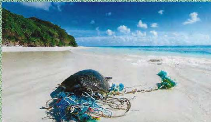
Dead endangered sea turtle washed up on beach with fishing net wrapped around it