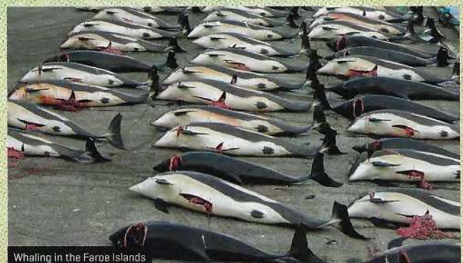
Whaling in the Faroe Islands

Plastic is indeed one of the biggest issues—it really is a