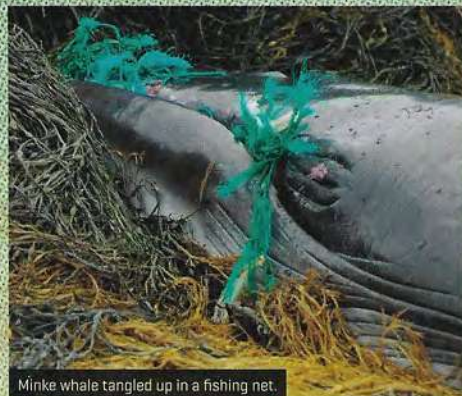
Minke whale tangled up in a fishing net.