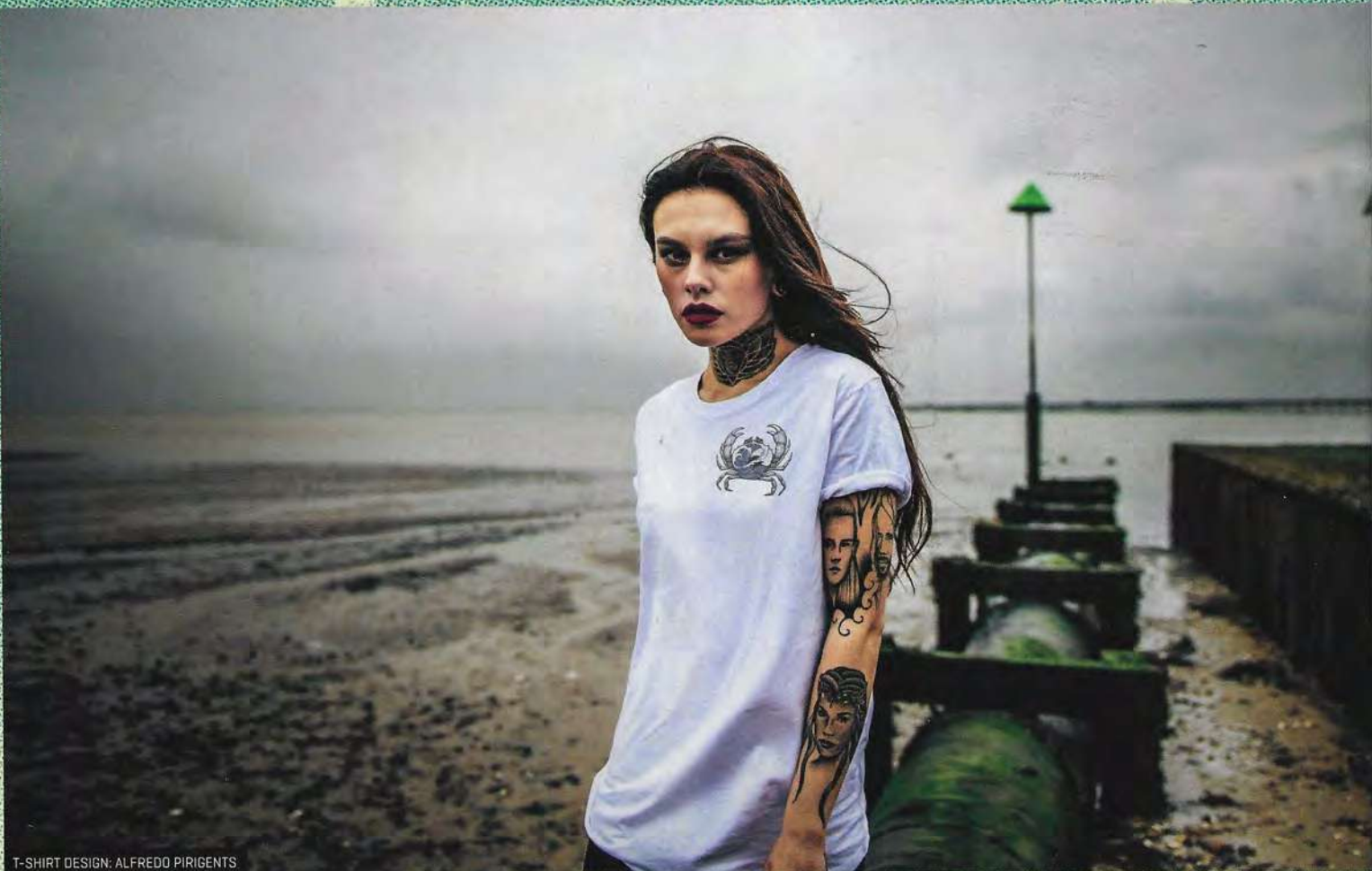
T-SHIRT DESIGN: ALFREDO PIRIGENTS