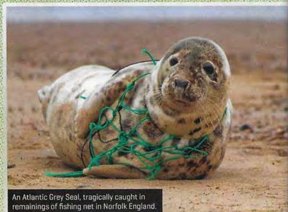
An Atlantic Grey Seal, tragically caught in remainings of fishing net in Norfolk England.

About 90% of all large shark species have been fished out of the oceans in the last 50 years or so. We can't begin to perceive the danger this places in