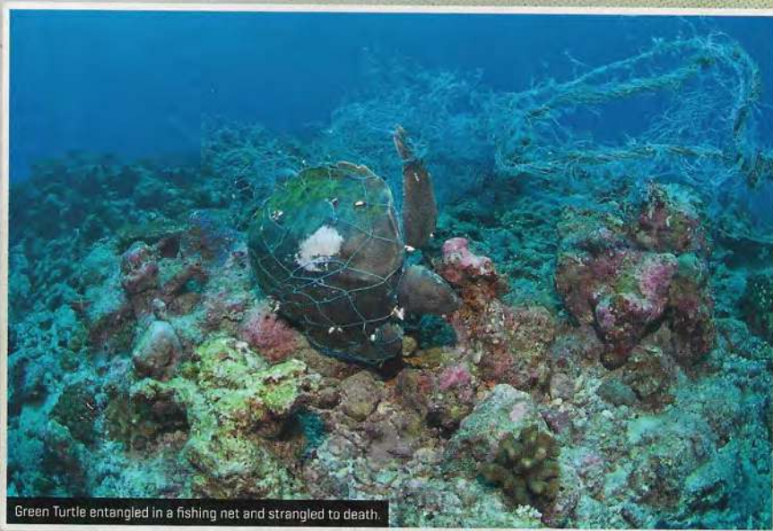
Green Turtle entangled in a fishing net and strangled to death.