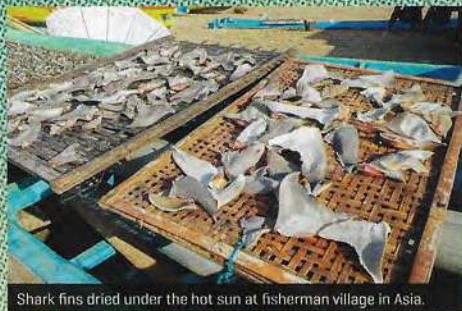
Shark fins dried under the hot sun at fisherman village in Asia.